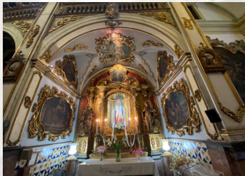
2. Miraculous Virgin Chapel