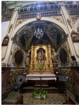
1. Saint Joseph Chapel