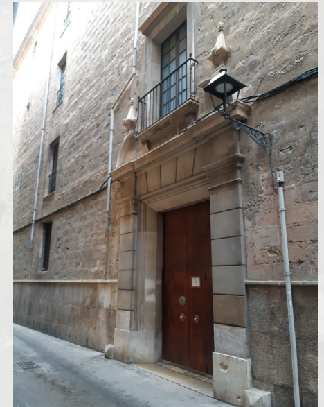
Church of the Congregation of the Mission since 1764